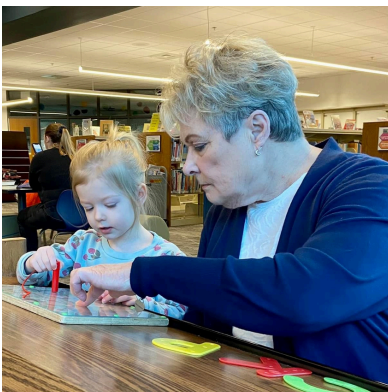
Early literacy programs at public libraries are trained by the State Library to pair literacy with play, movement, and technology. State library cuts would eliminate this staff.

Indiana residents use libraries to thrive. A 30% cut would devastate essential services, limiting access to information, educational resources, and community support for countless Hoosiers. Defunding would disproportionately impact vulnerable populations, including students, seniors, individuals with disabilities, and those in rural areas.