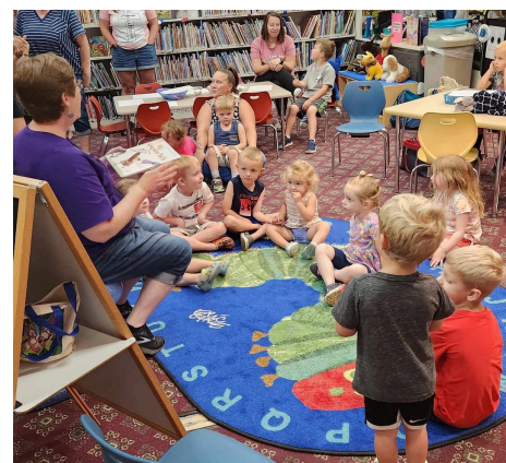
(Left) The State Library provides essential materials for Hoosiers who are blind. (Center) InfoExpress delivery within the Evergreen consortium of inter library loans allows libraries to share resources and maximize budgets. (Right) Indiana State Library facilitates summer reading and trains children's librarians and staff to maximize storytime.